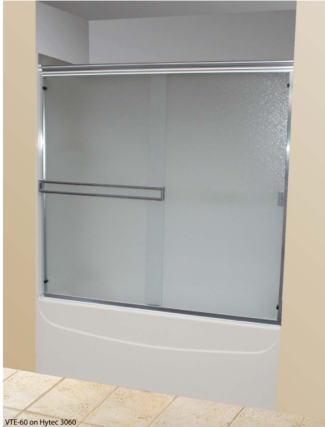
VTE-60 on Hytec 3060

See reverse for model #'s for applicable enclosures