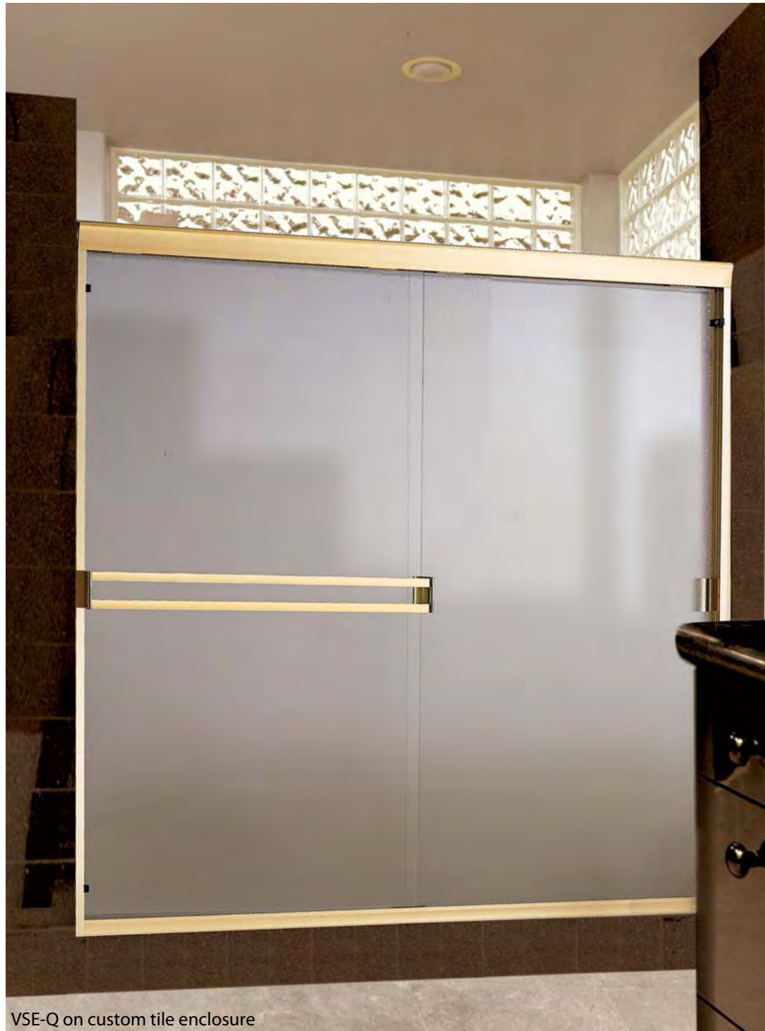
VSE-Q on custom tile enclosure

See reverse for model #'s for applicable enclosures