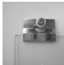
Panels glide on precision ball bearing rollers which allow sliders to open and close with the touch of a finger.