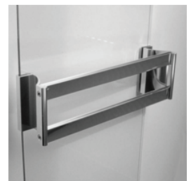
Frameless sliding panels with compression mounted easy-grip handle and towel bar.