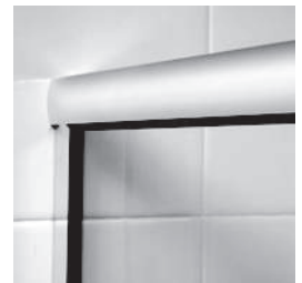
Contemporary smooth faced frame creates a striking enclosure to match any decor.