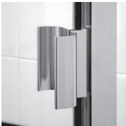
Compression mounted easy-grip handle.