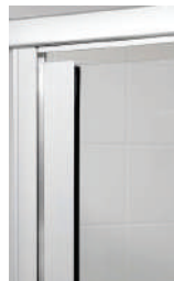
Innovative continuous hinge design provides superior durability.