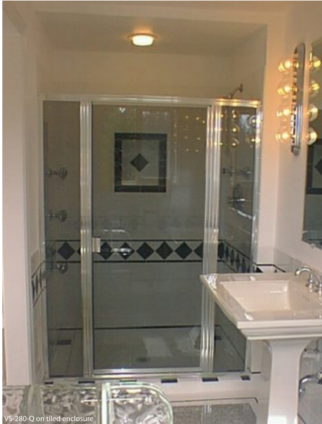
VS-280-Q on tiled enclosure

See reverse for model #'s for applicable enclosures