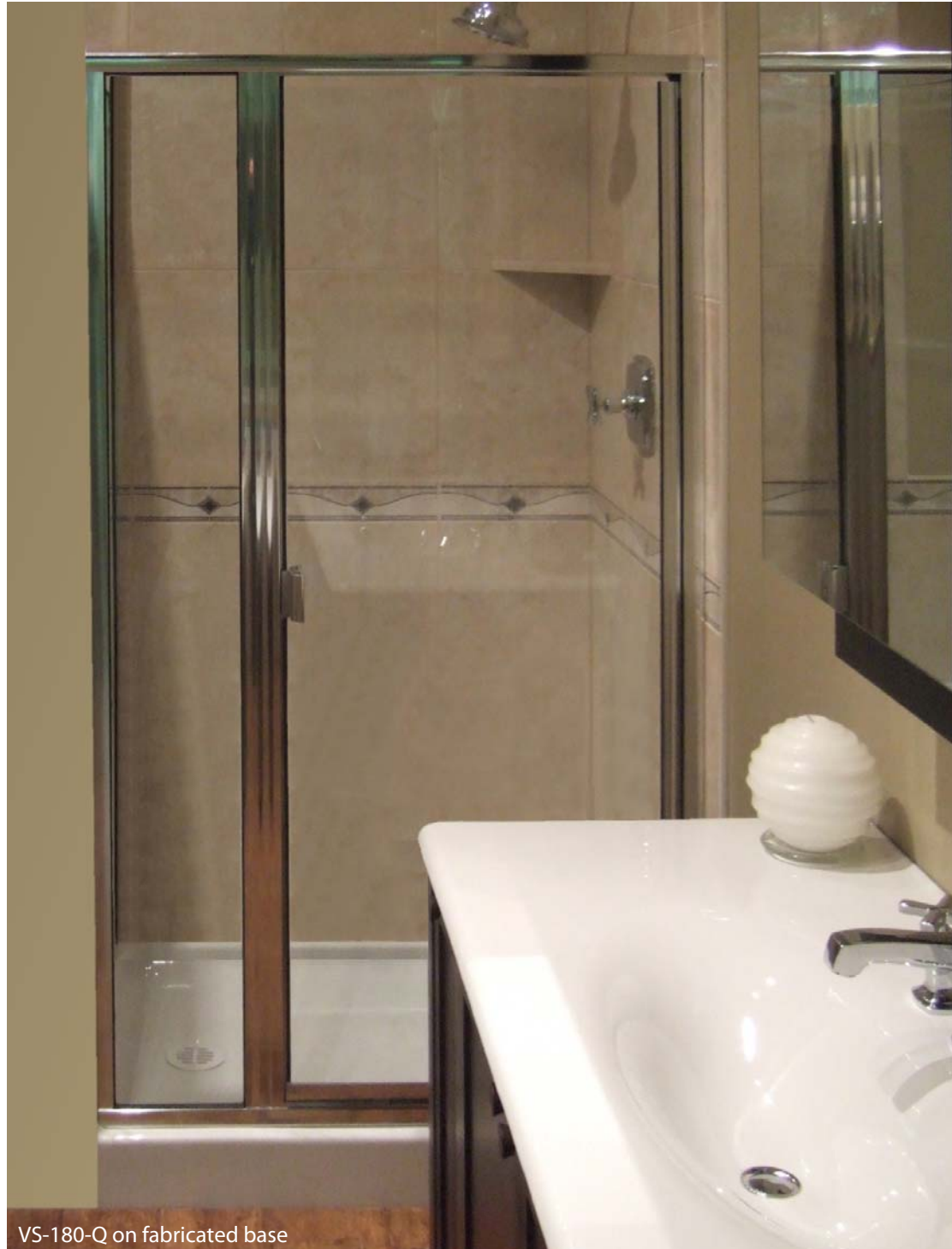
VS-180-Q on fabricated base

See reverse for model #'s for applicable enclosures