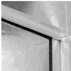
Sleek scalloped header with look of streamlined beauty.