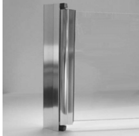
Continuous hinge rail system won't leak, rust or stiffen.