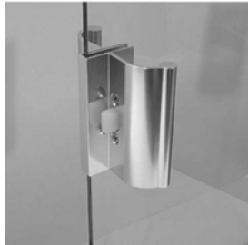
Unique 'Sure Catch' closure system securely snaps shut, opens easily and is adjustable.