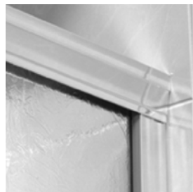
Sleek scalloped header with look of streamlined beauty.