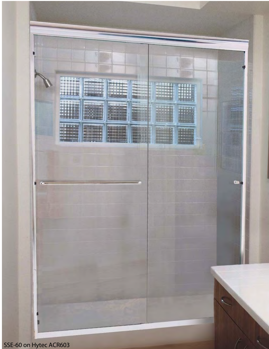
SSE-60 on Hytec ACR603

See reverse for model #'s for applicable enclosures