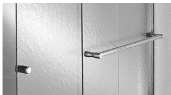
Towel bars are strong and streamlined, with no protruding screws or bolt heads.