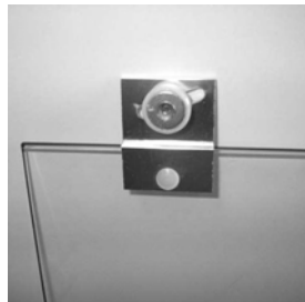
Panels glide on adjustable precision ball bearing rollers which allow sliders to open and close with the touch of a finger.