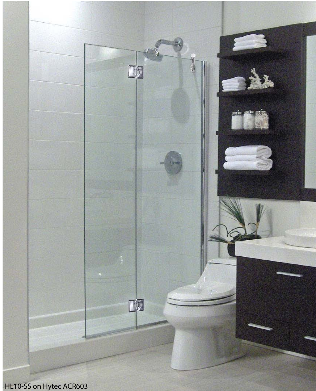
HL10-SS on Hytec ACR603

See reverse for model #'s for applicable enclosures