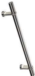
Solid brass single sided 16" pull with knob and stainless steel mounting hardware.