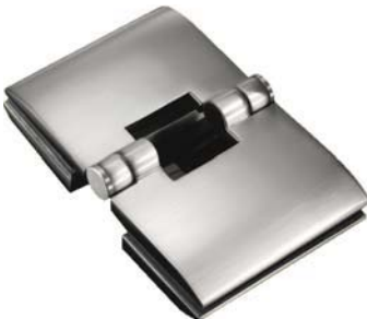
180 degree pivoting solid brass hinge with all stainless steel moving parts to ensure no rust or stiffening.