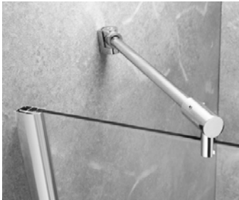
Unique wall brace stabilizes fixed panel, eliminating the need for a header.