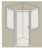
Neo-angle with door in middle & 2 step-up panels