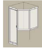
Neo-angle with door at wall & 2 step-up panels

Circle applicable door configuration and indicate if installation is to be mirror image. Provide all centreline dimensions and indicate any wall/sill outages.