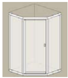
Neo-angle with door in middle