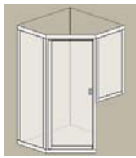
Neo-angle with door in middle & 1 step-up panel