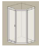
Neo-angle with door at wall