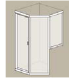
Neo-angle with door at wall & 1 step-up panel