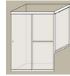
2 panel shower slider & step-up 90 degree return