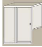
In-line, door & step-up 90 degree return