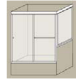
2 panel tub slider & step-up 90 degree return

Circle applicable door configuration and indicate if installation is to be mirror image. Provide all centreline dimensions and indicate any wall/sill outages.