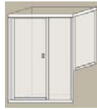
Door, in-line & step-up 90 degree return