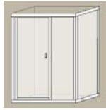
Door, in-line & 90 degree return