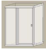
In-line, door & 90 degree return