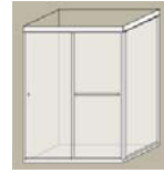
2 panel shower slider & 90 degree return